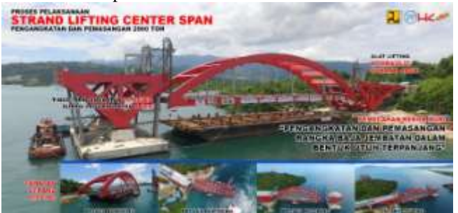
Fig. 2. Center Span Appointment in Jayapura

All innovations that have been planned continue to be finalized and realized with careful planning and calculations, until this innovation is approved by all parties, especially by The Bridge and Tunnel Road Safety Commission (KKJTJ) which oversees the design to the implementation of the Holtekamp bridge. Based on the innovation of delivering a complete frame of 3200 km and lifting a complete frame, this project received 2 Indonesian MURI records (Delivery and Lifting). With the implementation of these innovations, the installation of structural steel is carried out 6 months faster than using the on-site method. So that the Youtefa bridge can be completed earlier than the target set by the government from 2019 to September 2018.